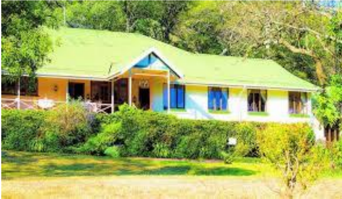
SAAFA Nation Congress was held at the Avoca Vale Country Hotel located in a scenic and picturesque surrounding in the foothills of the Soutpansberg Mountain Range near Louis Trichardt.